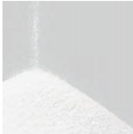
The basis: 60 % pure, fine-ground quartz powder