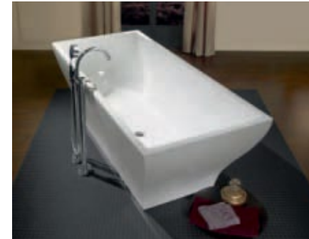
La Belle bath