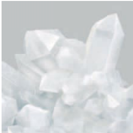
It all starts with quartz crystal