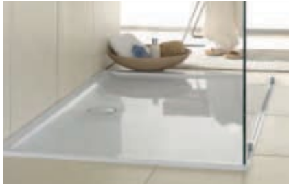
Futurion Flat shower tray