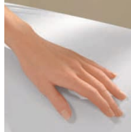
Smooth, pore-free surface

Quaryl® products also have slip-resistant properties. This creates a feeling of safety.