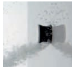
Invisible Jets pop-up side jets