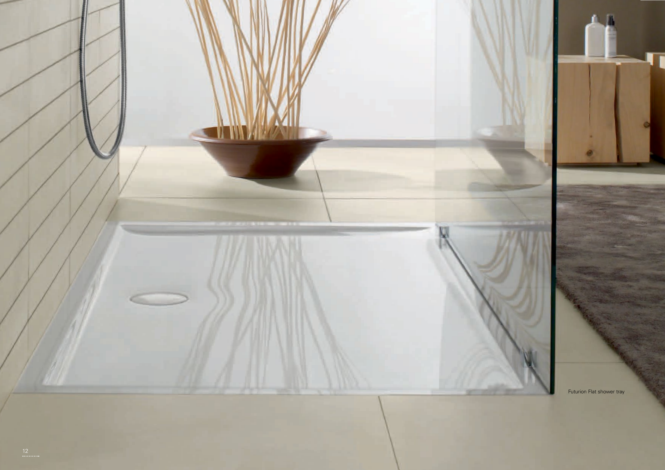
Futurion Flat shower tray