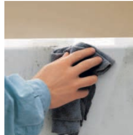
Easy to clean